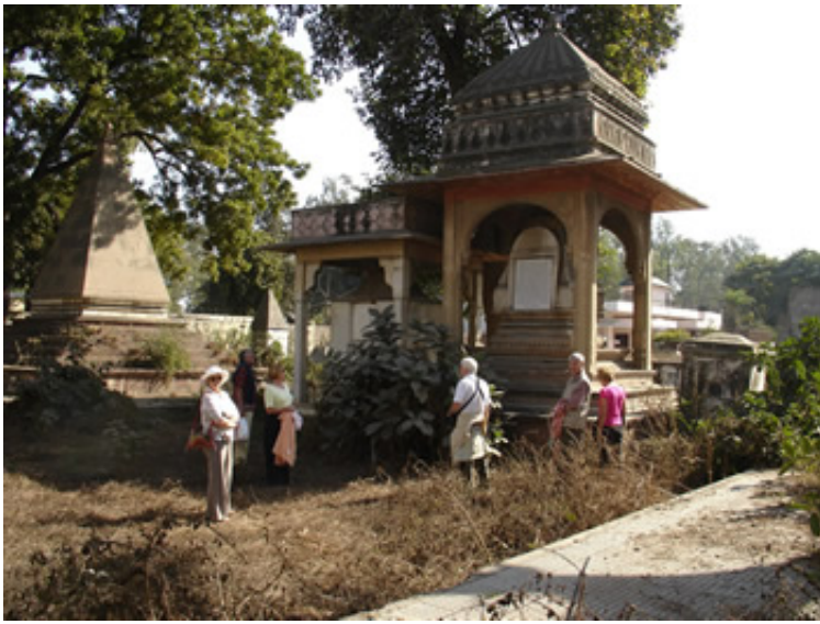
Before the society took over maintenance

The Cemetery was an overgrown tangle used by stray animals and drinkers as a haven. The British Association of Cemeteries in South East Asia came to know of it and gave money to INTACH for the conservation of the main graves. Later, the Urban Improvement Trust gave money for raising the boundary wall and some raised paths on condition that a system was put in place to maintain it. (They even tried to make a garden but this idea was never practical.)