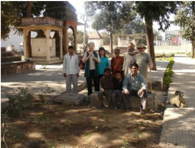
Society members and friends shrub planting

The Cemetery was an overgrown tangle used by stray animals and drinkers as a haven. The British Association of Cemeteries in South East Asia came to know of it and gave money to INTACH for the conservation of the main graves. Later, the Urban Improvement Trust gave money for raising the boundary wall and some raised paths on condition that a system was put in place to maintain it. (They even tried to make a garden but this idea was never practical.)