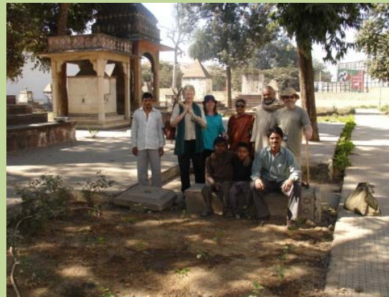
Shrub planting 2009

This piece of history lay neglected for decades. It was restored by INTACH with money donated by BACSA, but is now maintained by the Kota Heritage Society through subscriptions of its members.