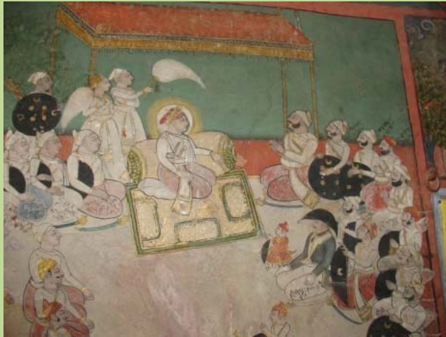
A British Political Agent being received at Court from a wall painting in Kota Garh.