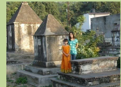
The shared grave: Photo taken to mark the 150 th Anniversary of the Kota Uprising in Oct 2007