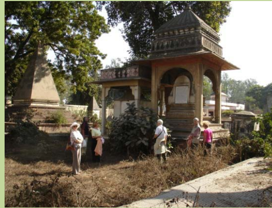
Visitors to the Cemetery in 2007

This brochure has been designed and published by the Kota Heritage Society. June 2010